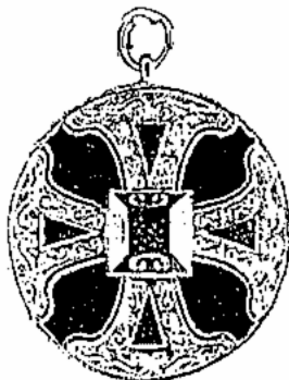
The Cross of St Augustine